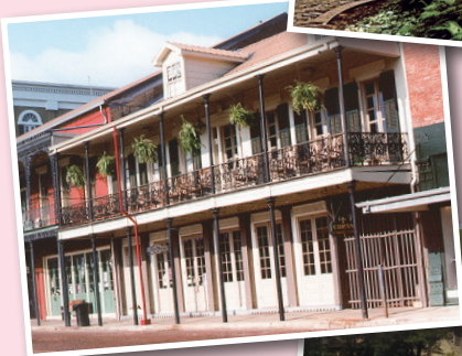
Truvy's No. 2